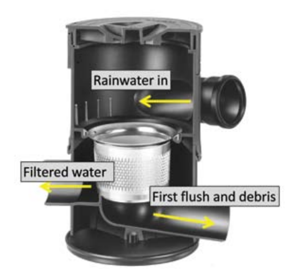
Diagram of a vortex filter.

Systems should be designed to protect and enhance the naturally occurring biofilm in the tank.