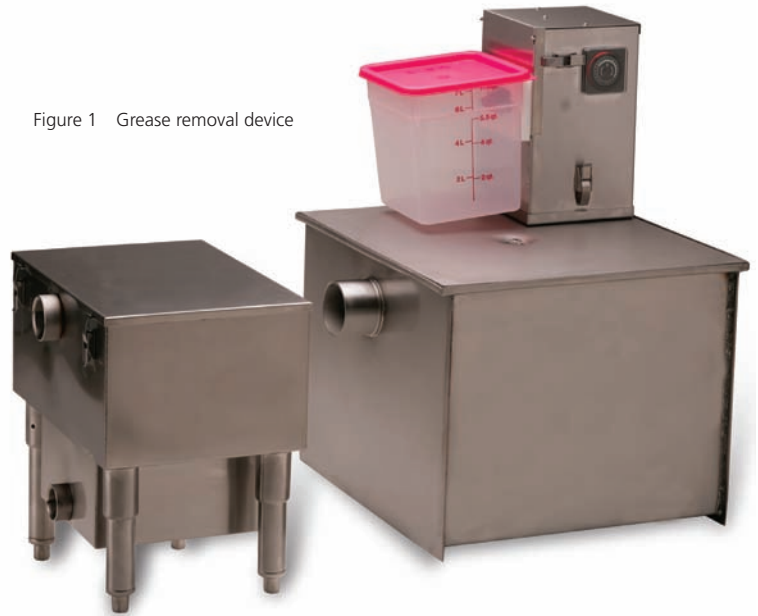
Figure 1 Grease removal device

The petroleum industry utilized the concept of mechanically removing collected oil from water earliest and most extensively. The design incorporates a band, belt, or rope rotating around an upper and lower pulley arrangement, with the lower pulley submerged in the vessel. The rising belt carries the oil up to a wiper or compression mechanism, discharging the oil to a receiving con-