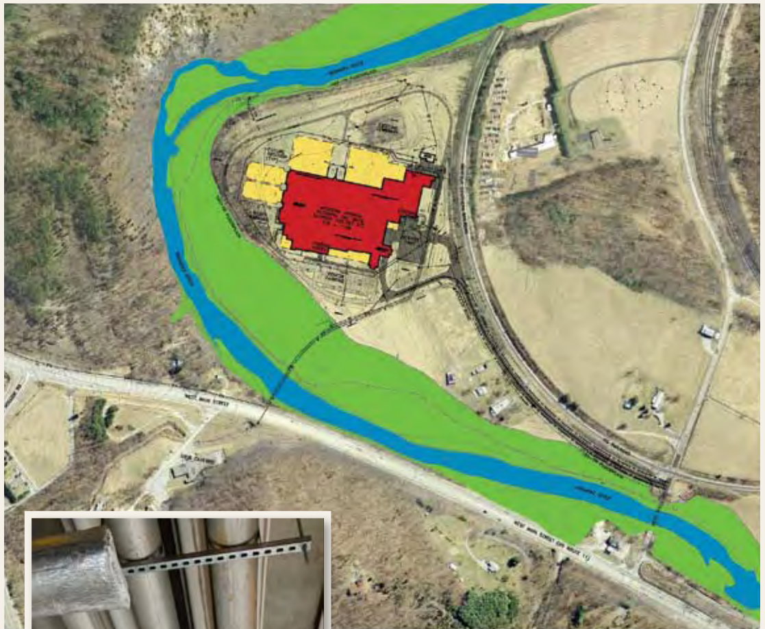
Figure 1 Site of the Western Virginia Regional Jail