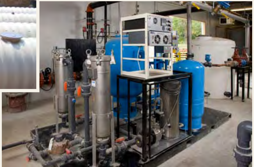
Figure 7 Rainwater harvesting system