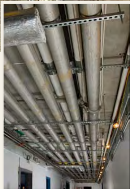
Figure 2 Overhead vacuum waste piping