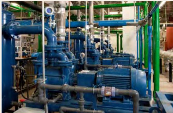
Figure 3 Vacuum pumps