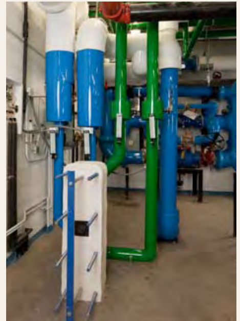
Figure 4 Plate frame heat exchanger near vacuum pump No. 1