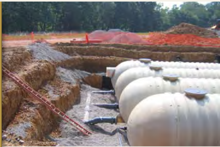
Figure 6 Underground storm water storage tanks