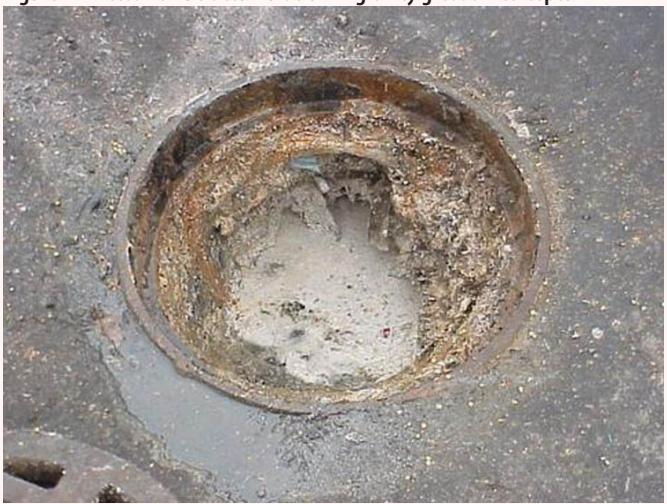
Figure 2 Excessive FOG accumulation in gravity grease interceptor

Reduction of globule size from sustained water temperatures above 150°F, concentration of detergents alone or in conjunction with other chemicals, mechanical emulsification via excessively long runs, or all of the preceding will have a dramatic effect on ascension rates. For example, a globule reduction to 20 microns will increase the time to rise 3 inches to nearly an hour with all other variables being the same.