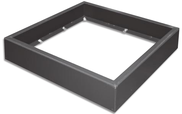
Series 800 Extension