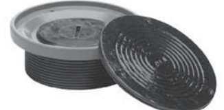
Series 410-20-23* (with closure plug)