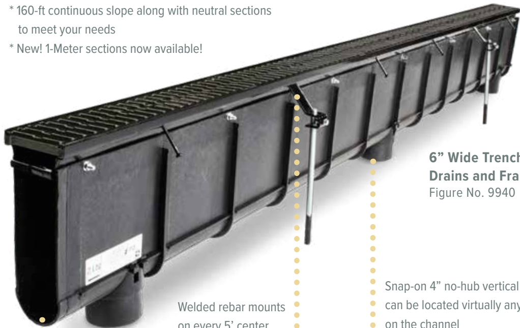
6" Wide Trench with Drains and Frame Figure No. 9940