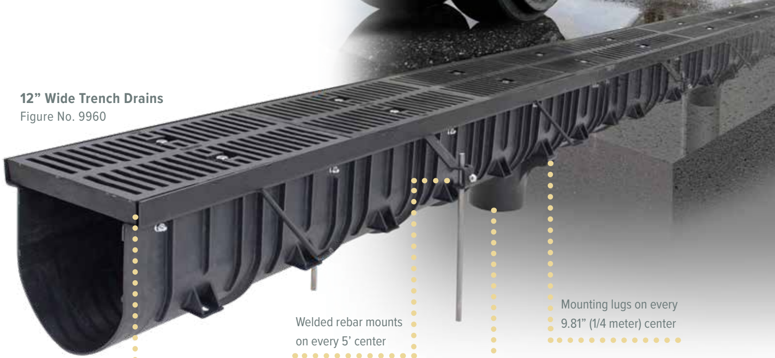
Figure No. 9960