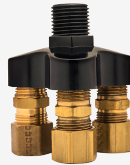
FIGURE NO. 2694DA-ABS-625 TRAP PRIMING DISTRIBUTION UNIT