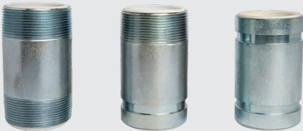
FIGURE NO. 950-TXT DIELECTRIC FITTING WITH THREAD BY THREAD