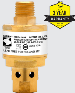
FIGURE NO. 2694 PRESSURE DROP TRAP PRIMER