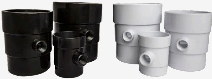
276 SERIES ABS TRAP PRIMING ADAPTERS