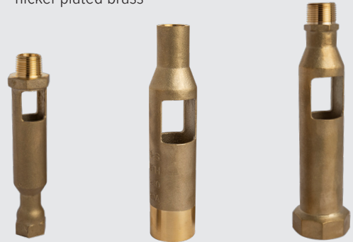
FIGURE NO. 280 1/2"-14NPT T THREADED OUTLET ONLY