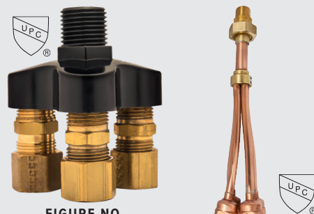
FIGURE NO. 2694DA-ABS-625 TRAP PRIMING DISTRIBUTION UNIT