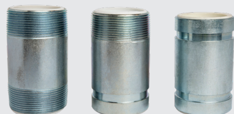
FIGURE NO. 950-TXT DIELECTRIC FITTING WITH THREAD BY THREAD