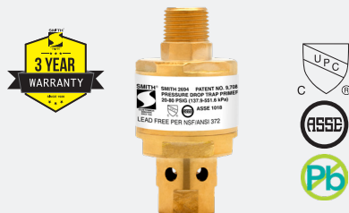
FIGURE NO. 2694 PRESSURE DROP TRAP PRIMER