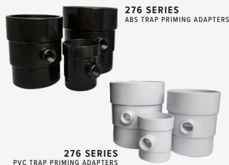
276 SERIES ABS TRAP PRIMING ADAPTERS